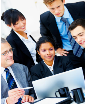
A cross-functional team works to effectively grow their organization.

High Performance Enterprises continually meet challenges head on, by understanding them, developing effective solutions and implementing needed changes as times and events demand. They are confident, fearless and adaptable organizations that nothing can stop!